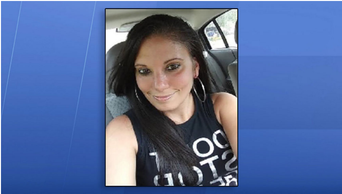
Estranged Husband of Missing Osceola Mom Named Person of Interest in Disappearance Osceola County | 3 days ago